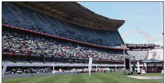
An open-air worship service at Kings Park stadium, Durban, South Africa.